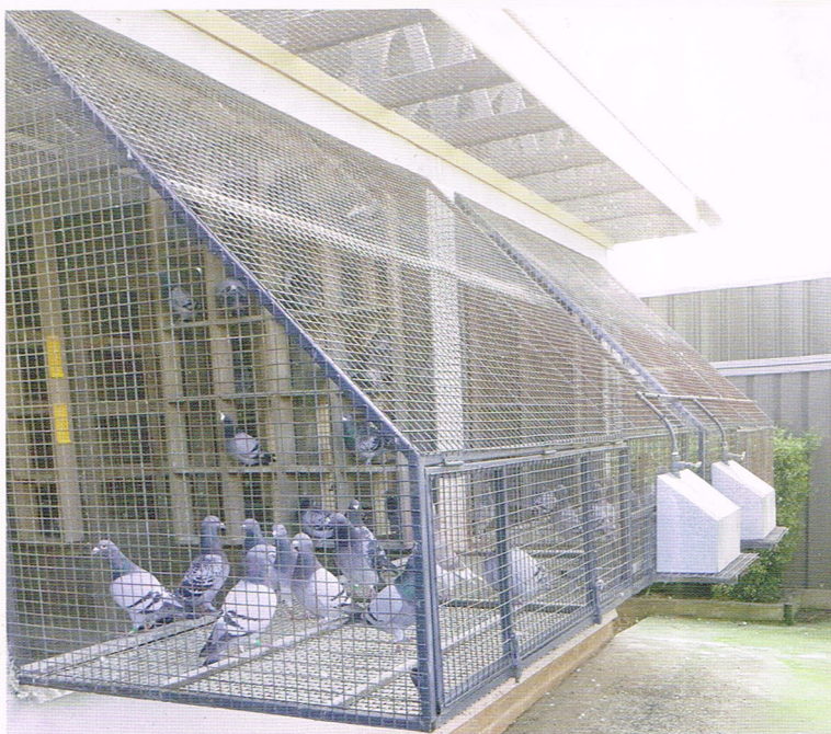
Alan's stock birds.